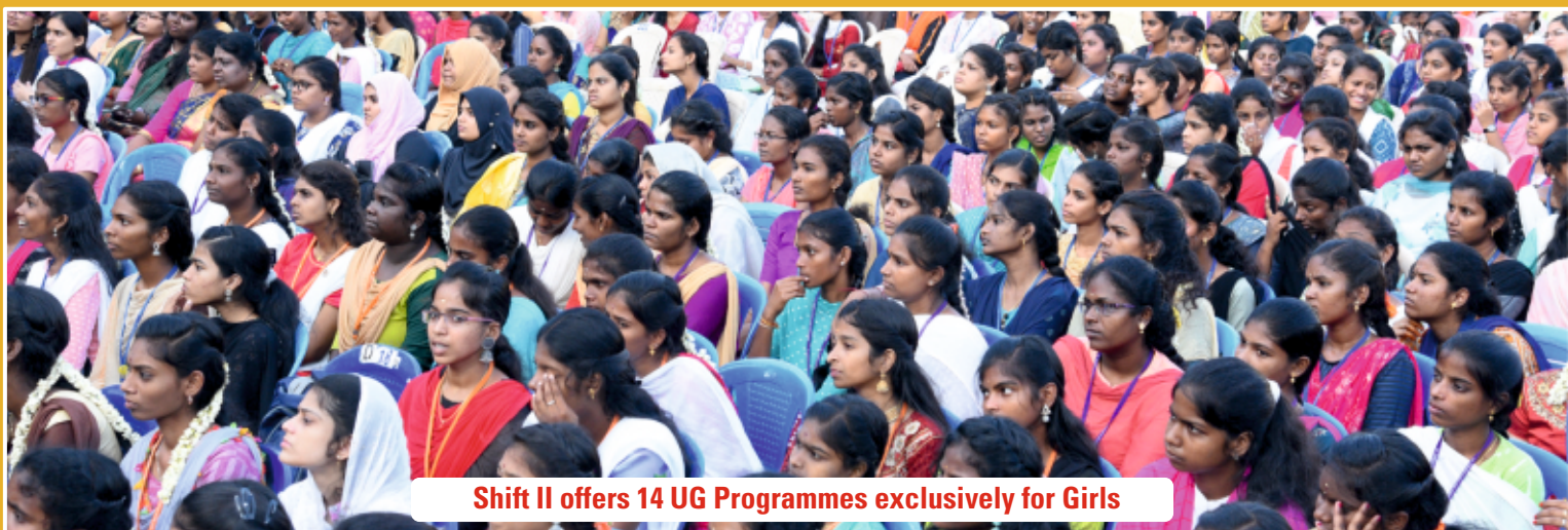
Shift II offers 14 UG Programmes exclusively for Girls

We expect high standards of behaviour and a sense of responsibility and self-discipline in our students. We instil the key values of Pride and Respect, which is a constant theme of assemblies and our Spiritual, Moral, Social and Cultural development programme.