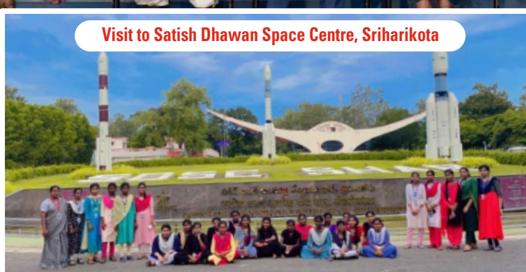
Visit to Satish Dhawan Space Centre, Sriharikota