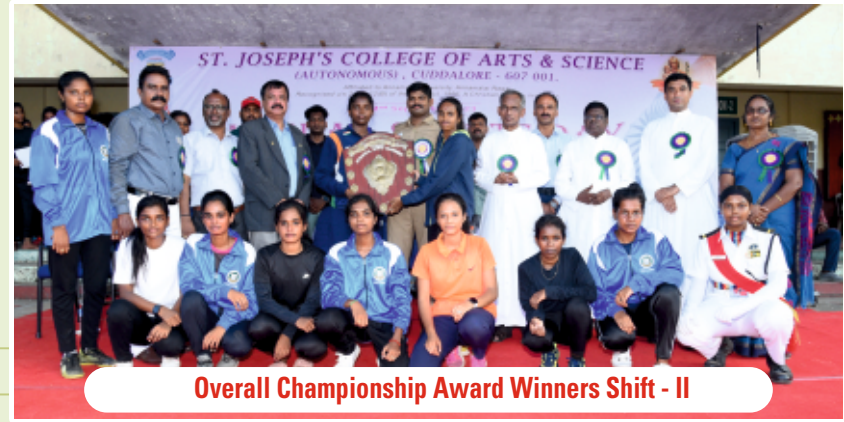
Overall Championship Award Winners Shift - II