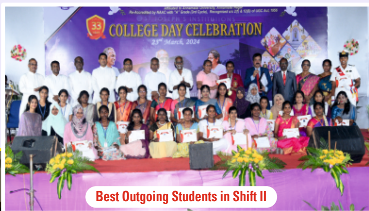
Best Outgoing Students in Shift II

The placement cell provides an organized corporate interface for St. Joseph's students. The cell is committed to tap the market that has come to recognize the sound academic training of the graduates. The placement cell also holds several workshops to give students information regarding centres of excellence in higher education and jobs in India and abroad. Assistance has also been offered in writing resumes and developing interview skills by conducting practice interviews. Top notch companies that recruit our students include Infosys, Wipro, HCL, TCS, etc.