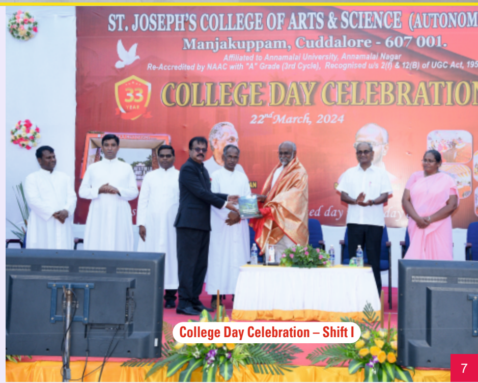
College Day Celebration - Shift I

The WEC in St. Joseph's has actively provided counselling to students to make them aware of their own capabilities and potential while sensitizing them to various issues in society, especially gender issues. The centre empowers women by helping them to develop their skills by building their confidence and by bringing out their latent leadership qualities. This is done through a series of seminars, debates, lectures, workshops, film screenings and self-defense training camps.