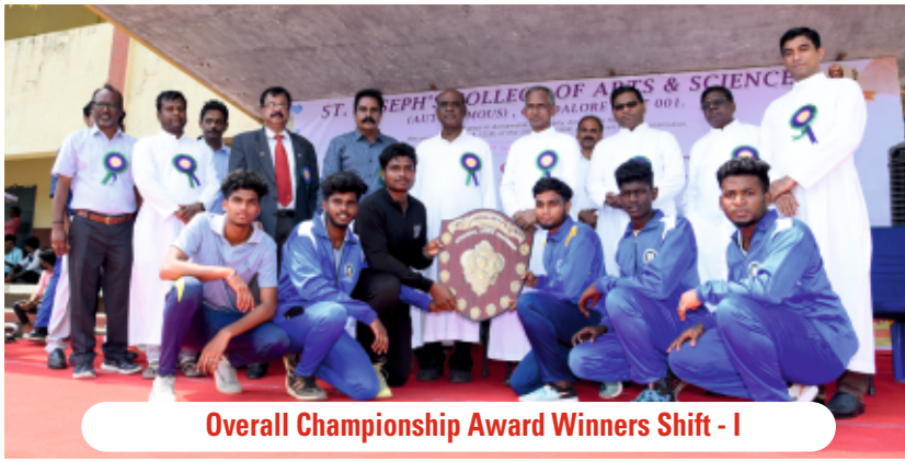
Overall Championship Award Winners Shift - I