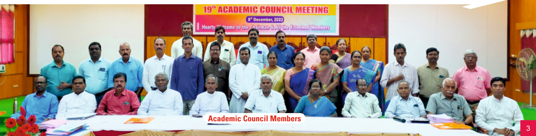
Academic Council Members