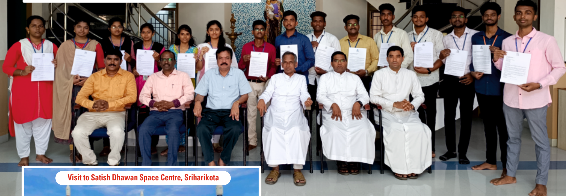
Final Year Students who received Offer letters from TCS, Chennai