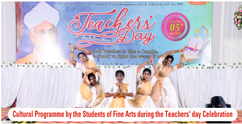
Cultural Programme by the Students of Fine Arts during the Teachers' day Celebration