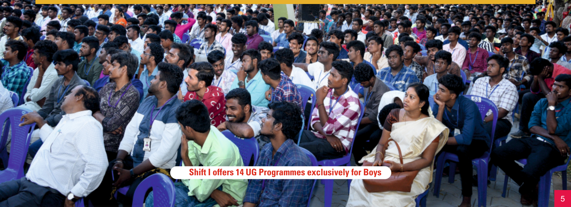
Shift I offers 14 UG Programmes exclusively for Boys