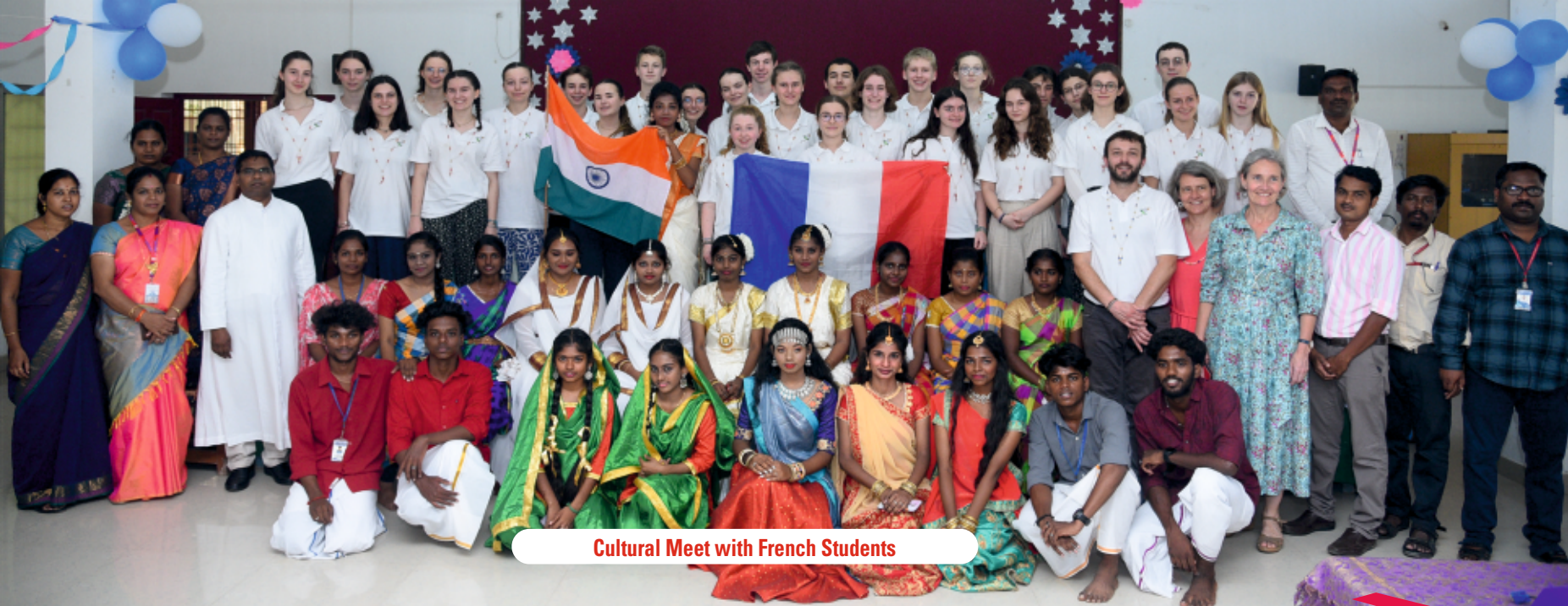
Cultural Meet with French Students