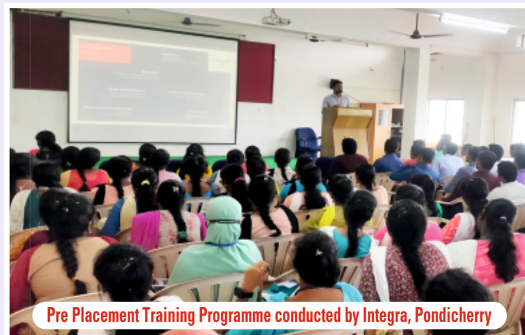
Pre Placement Training Programme conducted by Integra, Pondicherry

The purpose of this association is to bring together various alumni on a common platform. It has a formal structure with elected office bearers. Alumni meetings have emerged as a warm interactive ground for former students, their families and the faculty.