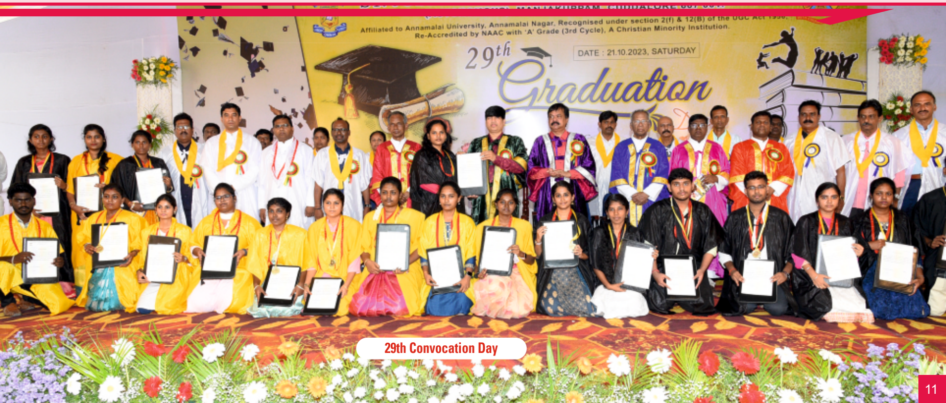
29th Convocation Day

THE COLLEGE DOES NOT ACCEPT DONATION in any form for admission. Any issue in this regard may be brought to the notice of the college authorities immediately.