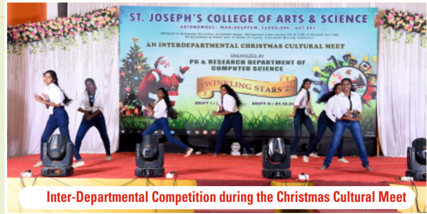
Inter-Departmental Competition during the Christmas Cultural Meet